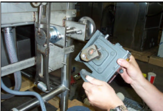
Removing the gear reducer.

24. Gently remove the gear reducer, careful not to drop it.